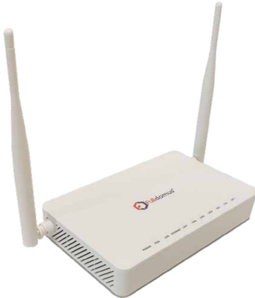
Picture 2-1 RL841GWVC-G product figure